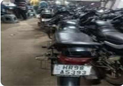
Hero HF Deluxe IBS Kick Alloy 100cc BS6 2021