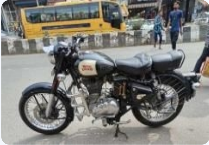
Royal Enfield Classic 350cc 2015