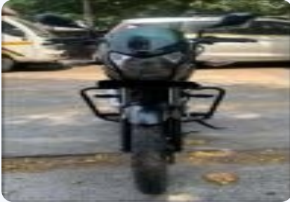
Hero Passion Xpro Disc Self Alloy 2014