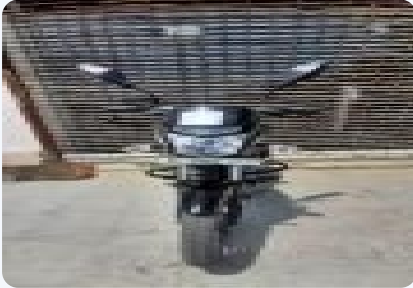
Bajaj Platina Alloy ES 100cc Disc FI BS6 2021