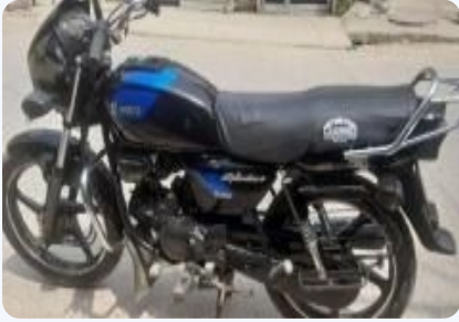
Hero Splendor Plus Kick Alloy 100cc IBS 2022