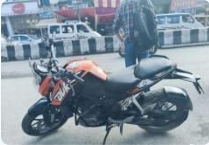
KTM Duke 200cc 2016