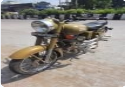
Royal Enfield Classic 500cc 2016