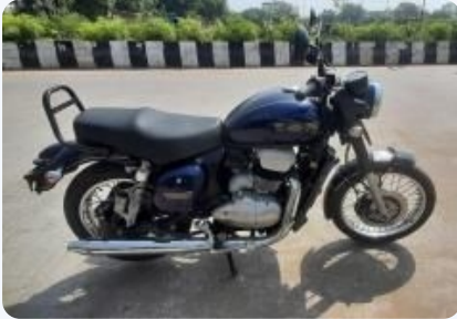
Jawa Forty Two 295CC 2020