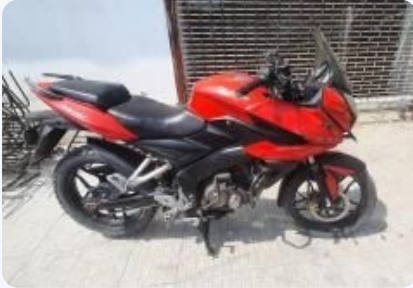
Bajaj Pulsar AS150 2015