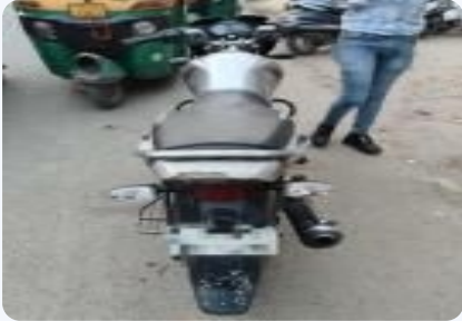
Bajaj Discover 125cc 2014