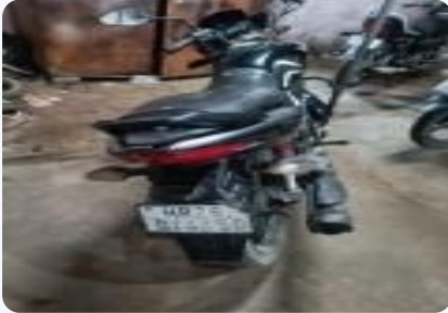
Hero Passion Pro i3S Alloy 100cc 2019