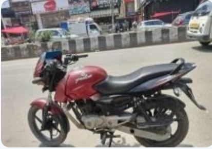
Bajaj Pulsar 150cc 2013