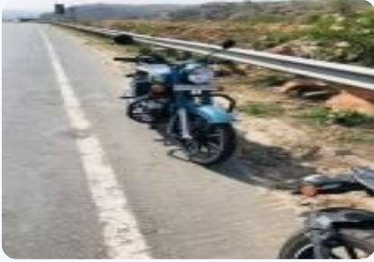
Royal Enfield Classic 350cc Signals Edition 2018