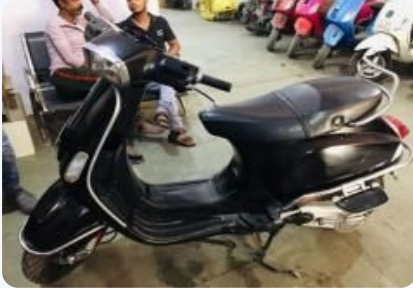
Piaggio Vespa 125cc 2015