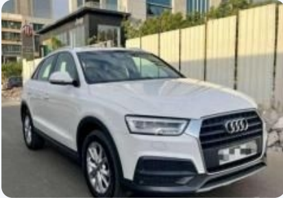
Audi Q3 30 TDI Premium FWD 2017