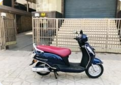
Suzuki Access Fi 125cc Drum CBS BS6 2022