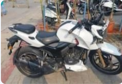
TVS Apache RTR 200 4V FI 2017