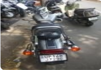
Bajaj Avenger 220cc 2011