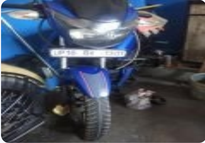
TVS Apache RTR 160cc 2016