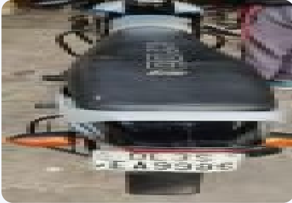
Bajaj CT 100 100cc 2018