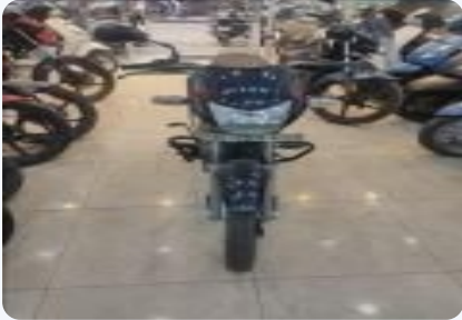
Bajaj CT 100 100cc 2020