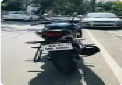
Honda CBR 250R 2011