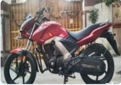
Honda CB Unicorn 160 STD 2015