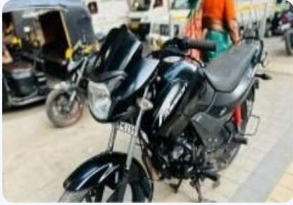
Hero Passion Pro 110cc Disc BS6 2020