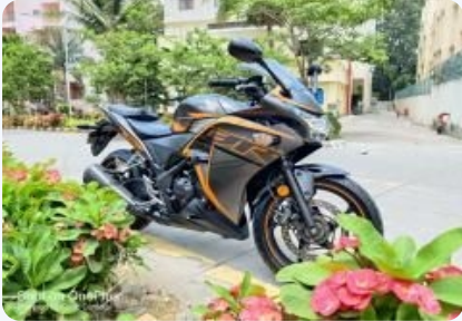
Honda CBR 250R 2018