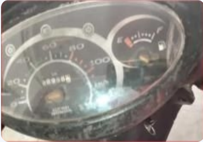
Hero Pleasure 100cc 2010