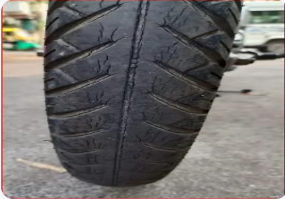
Royal Enfield Classic 350cc 2014