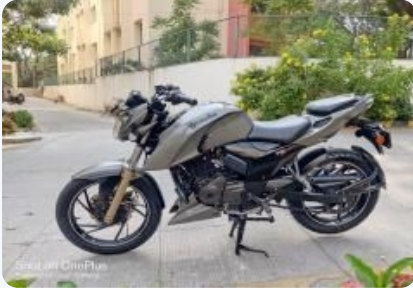
TVS Apache RTR 200 4V FI 2016