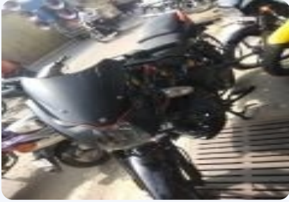
Bajaj Pulsar 125cc Drum BS6 2021