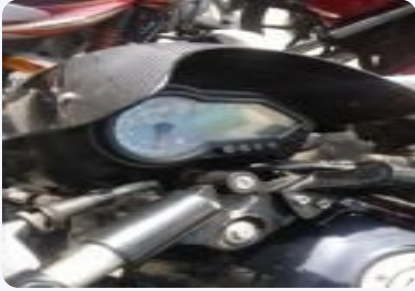
Bajaj Pulsar 150cc 2013