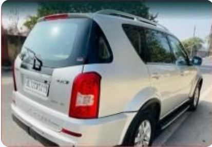
Mahindra Ssangyong Rexton RX7 2014