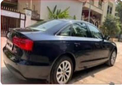
Audi A6 2.0 TDI 2013