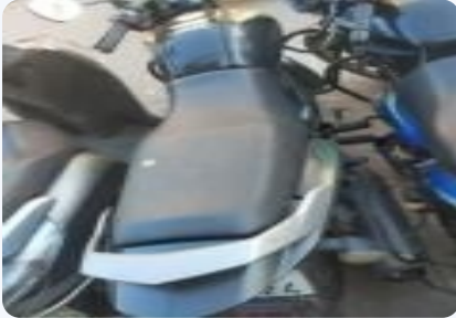
Yamaha Saluto 125cc 2019