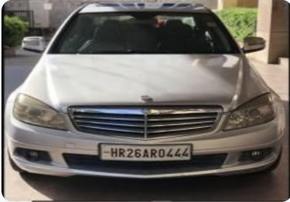
Mercedes-Benz C-Class C200 Kompressor 2008