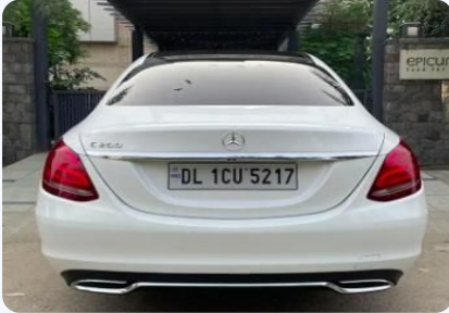
Mercedes-Benz C-Class C 220d Progressive 2016