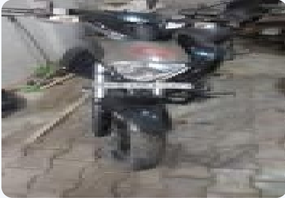
Suzuki Intruder 150cc 2019