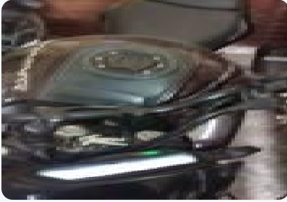
Bajaj Dominar 400 2017