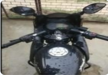
Bajaj Pulsar 150cc 2014