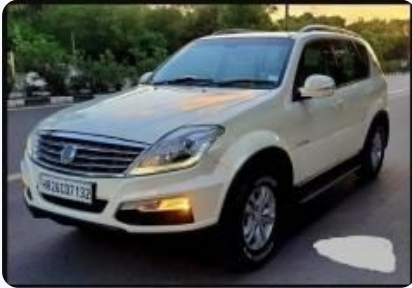
Mahindra Ssangyong Rexton RX7 2014