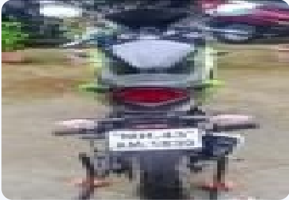
Honda CBR 150R 150cc 2012