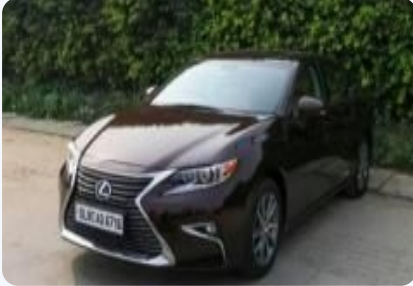
Lexus ES 300H 2017