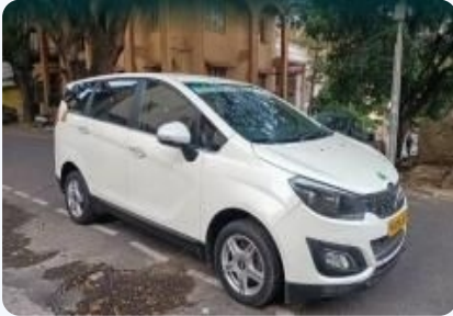
Mahindra Marazzo M6 7 STR 2019