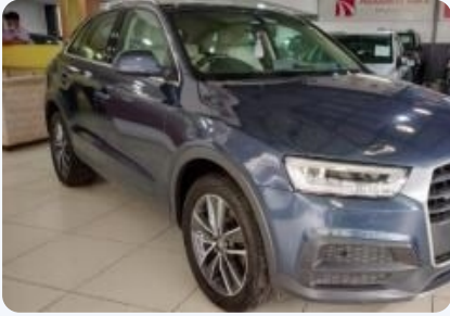
Audi Q3 35 TDI quattro Technology 2018