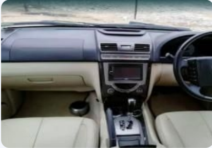
Mahindra Ssangyong Rexton RX7 2013