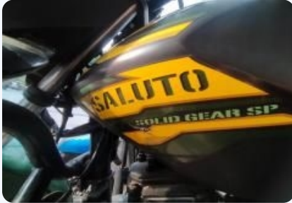
Yamaha Saluto 125cc 2017