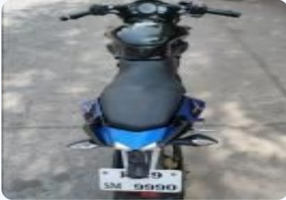
Bajaj Pulsar 200 NS 200cc 2014