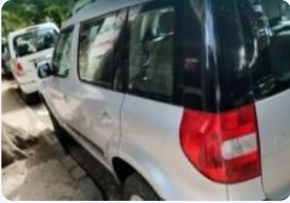
Skoda Yeti AMBITION 2.0 TDI 4X2 2013