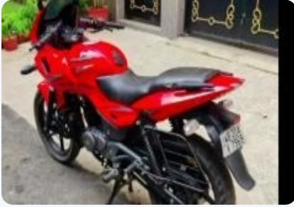
Bajaj Pulsar 220cc 2018