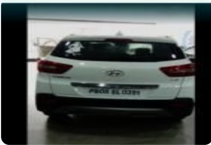
Hyundai Creta 1.6 SX Opt Diesel 2019