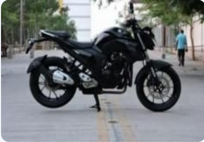
Yamaha FZ25 250cc 2018